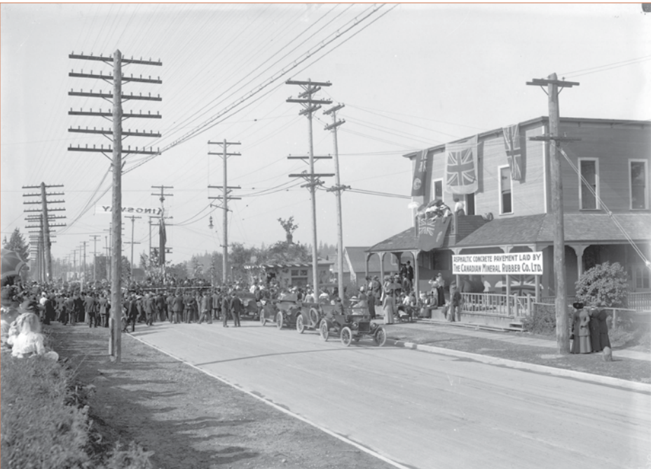
1913 renaming of New Westminster Road to Kingsway; corner of Kingsway and Boundary looking NW, with the Masonic Hall on the right.