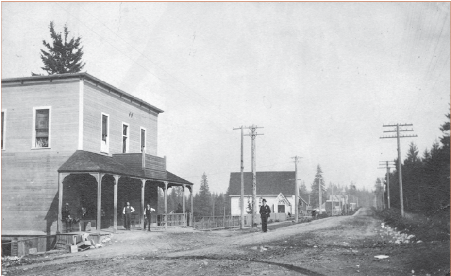
1900s Kingsway looking East from Boundary Road; Central Park Masonic Hall and Central Park Presbyterian Church on the left. Vancouver Archives.