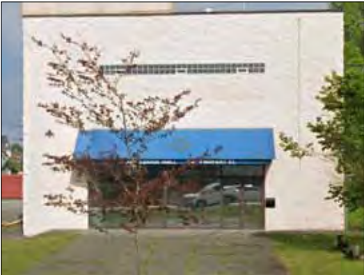
The Lodge now meets at the building located at 4474 Rupert

The Lodge now meets at the building located at 4474 Rupert, in the Collingwood area, and is known as Heritage Lodge No 63, which opened in 1978. (Information taken from Park Lodge 63 heritage website.)