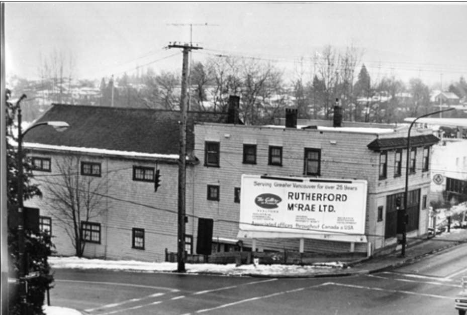
1960 Masonic Lodge at the corner of Kingsway and Boundary, looking East.