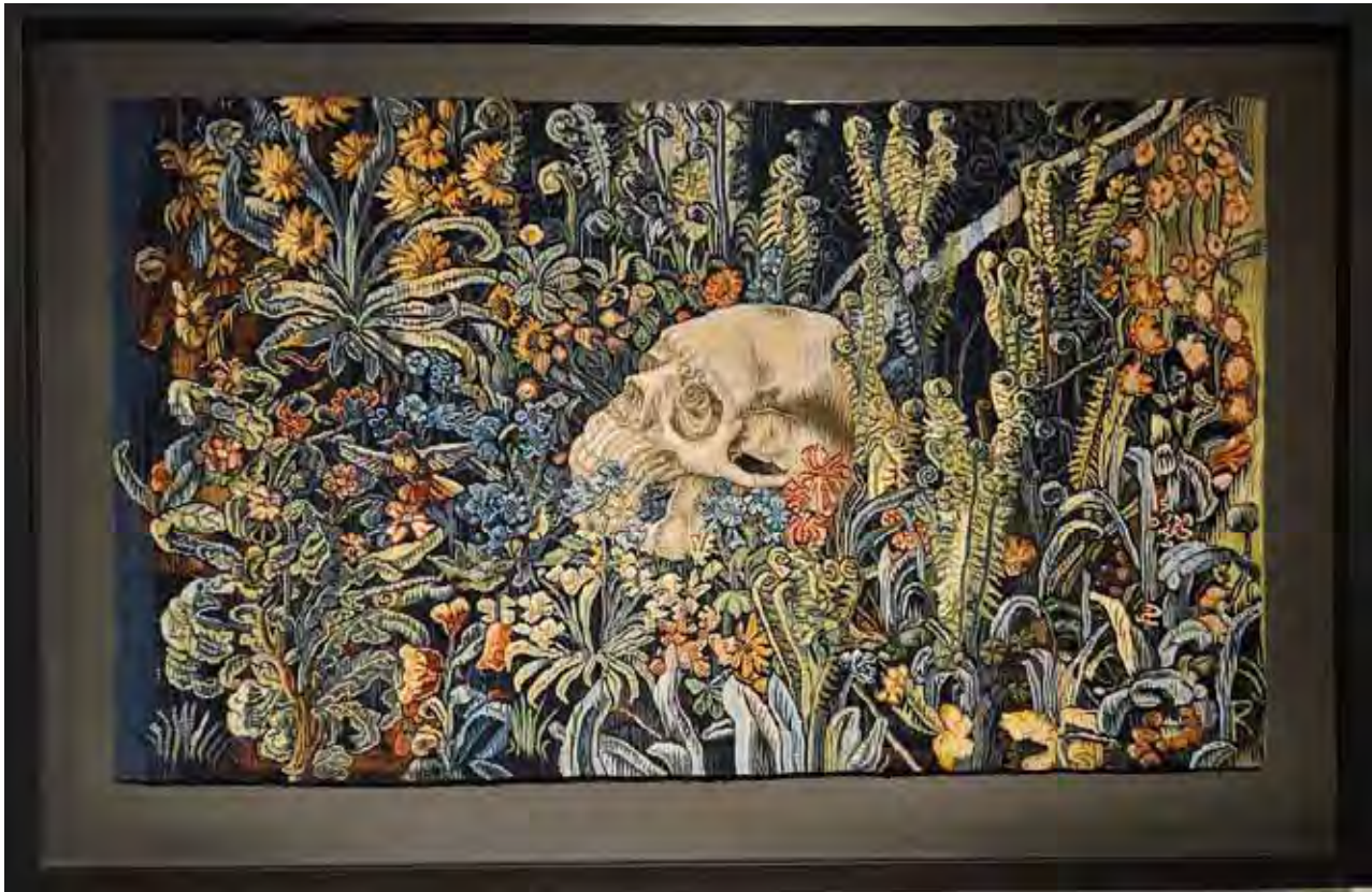
Rest and be Thankful: The Skull Tapestry. Handwoven Tapestry, wool and cotton. 28 x 38 in.