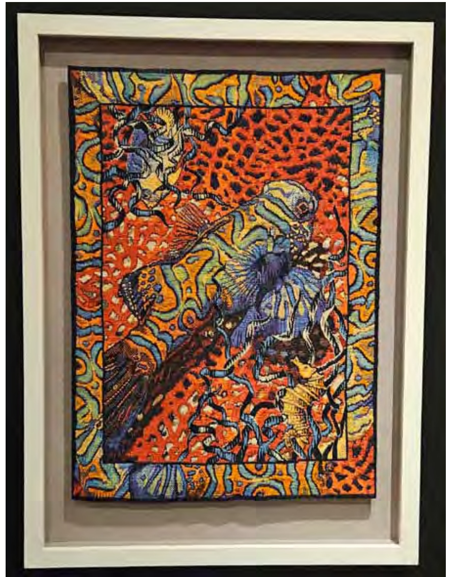
Tidepool. Handwoven Tapestry, Wool and cotton. 28 x 36 in