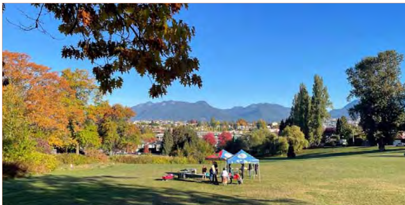
Still Moon Arts Society at Falaise Park, future site of Green Rainwater Infrastructure.

Slocan, Beaconsfield, and Falaise Parks have been selected as sites to develop GRI to support the Still Creek Watershed in Renfrew-Collingwood. Slocan will feature a new rain garden and Beaconsfield will be home to a new seasonal wetland. Both will be built this