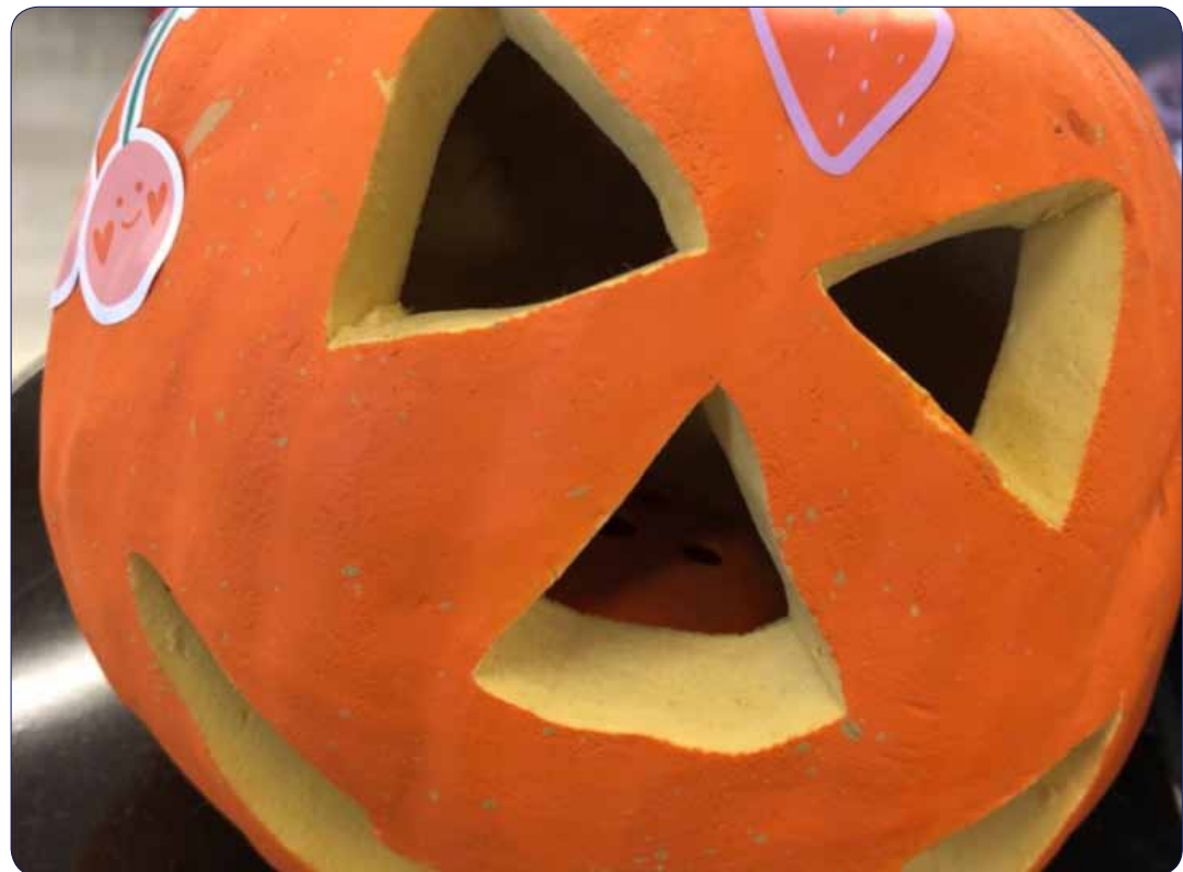
Jack-o'-lanterns are fall favourites.