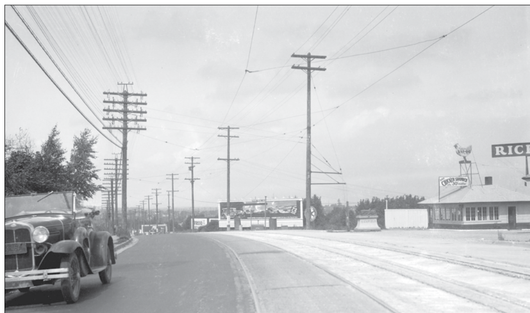
A photo of 3075 Kingsway in 1932, showing the Barbeque Super Serve. Below, the same location in 2023.

Today, in 2023, the Cassandra Hotel is at this location near Spencer street, opening in 1978. There is a Big O Tires shop here too.