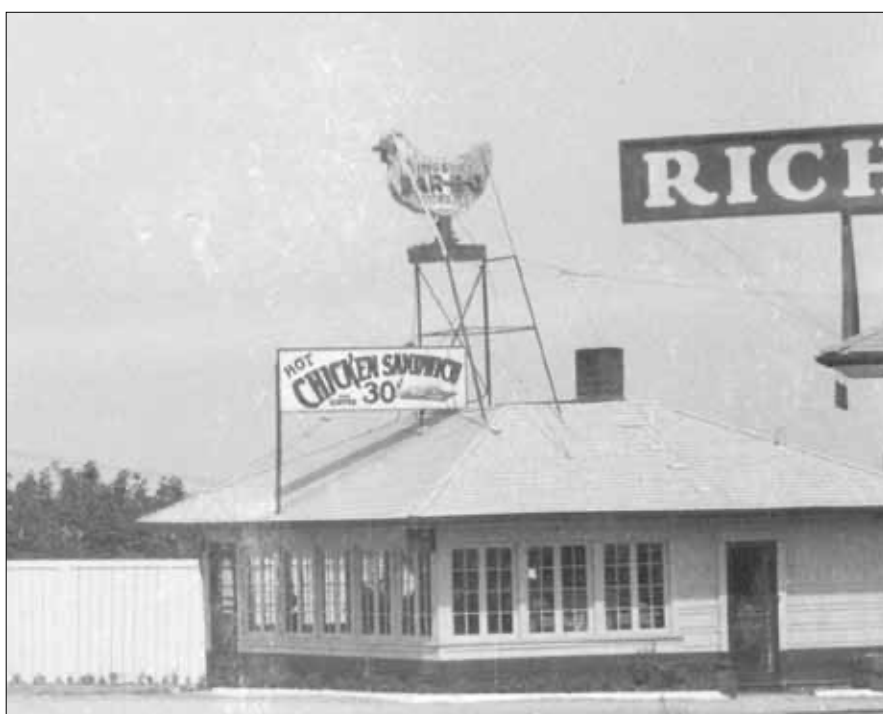
A closeup up the Barbeque Super Serve restaurant with a special for the hot chicken sandwich for 30 cents!