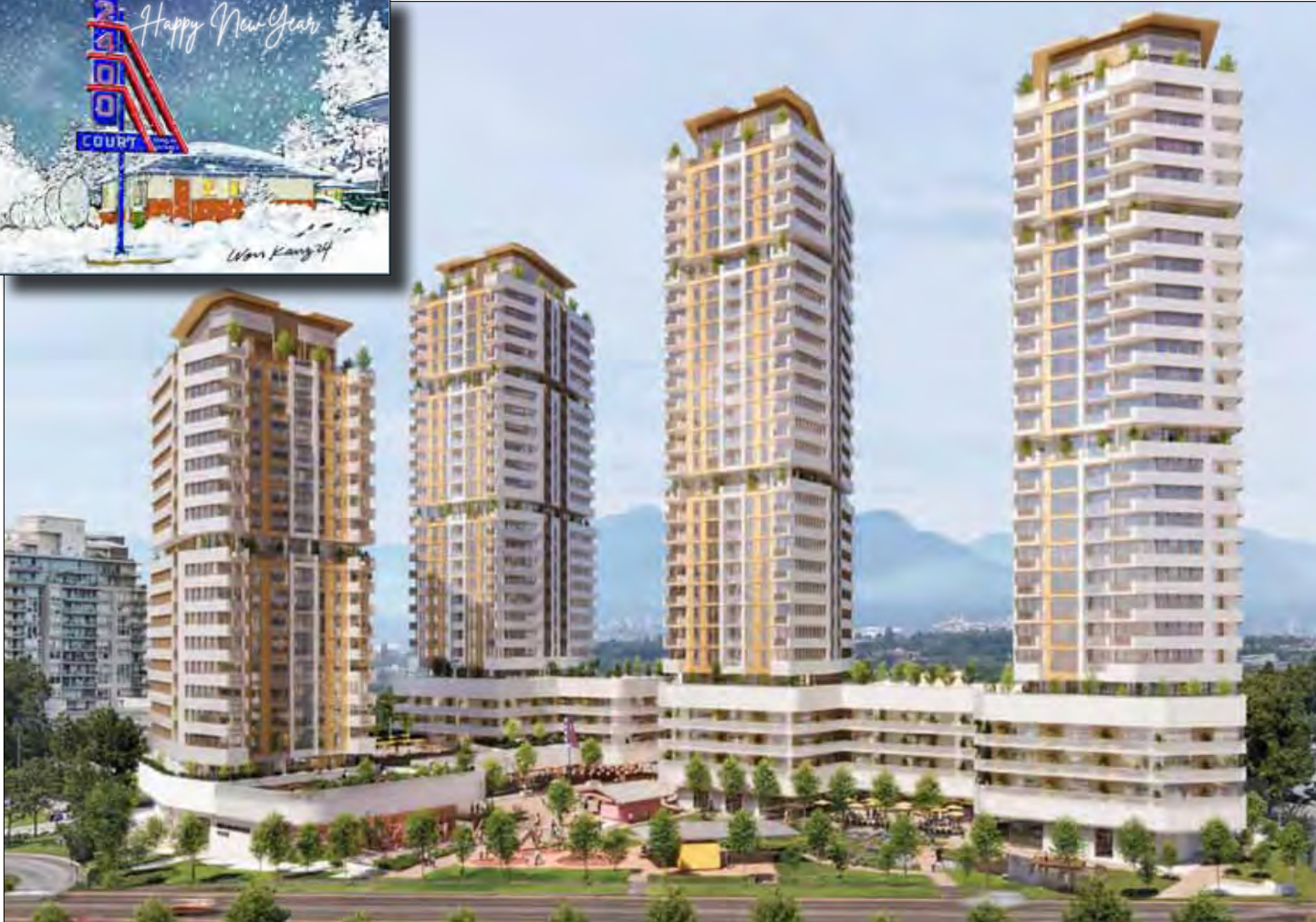
Conceptual plans for the 2400 Motel redevelopment. Acton Ostry Architects/City of Vancouver)

by Paul Reid Most people in Renfrew-Collingwood know the 2400 Motel, even if only from the neon sign glowing over Kingsway. Built in 1946, it's the last intact post-war motor court left in Vancouver — and one of the very few surviving examples of its kind anywhere in North America!