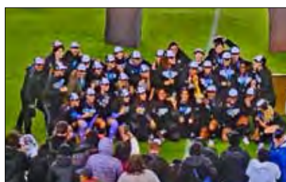
Congratulations to The Rise FC

Where the word “soccer” actually comes from