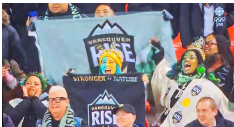
Vancouver Rise fans celebrating the historic victory in Toronto on Saturday, November 15, 2025.

The Northern Super League is Canada’s new top-flight professional women’s soccer league, and Vancouver Rise FC is one of its six founding clubs. Even better for local fans, they play their home matches right in our backyard at Swangard Stadium, bringing top-level women’s soccer back to a historic Lower Mainland venue.