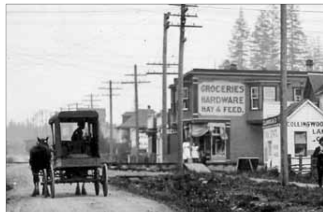
402 Joyce was the grocery store, at Vanness near the BCER tracks. 412 Joyce was the PO, one of those buildings just past the grocery store.