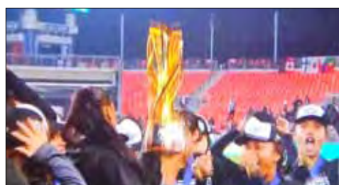
Lifting the Diana B. Matheson Cup