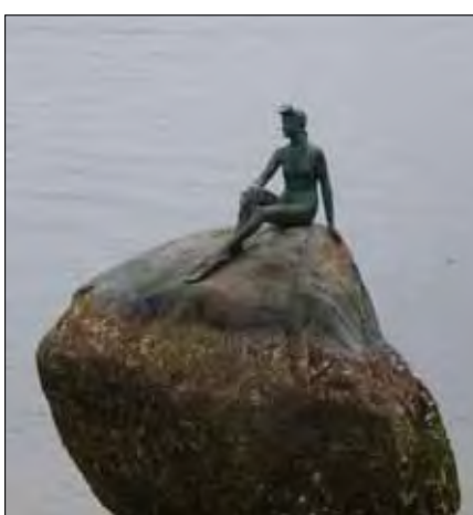
Girl in Wet Suit.