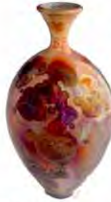
Holly McKeen, Layered luster crystalline glazes on porcelain bottle form

The 70th Anniversary Exhibition of the Potters' Guild of BC