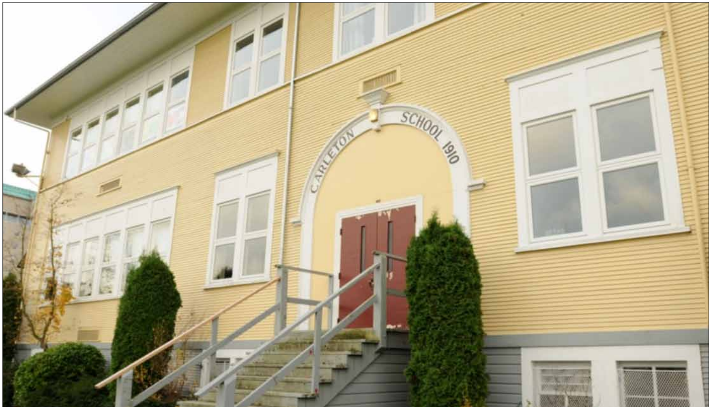
Photos from the SAVE Sir Guy Carleton Elementary School Faecbook page