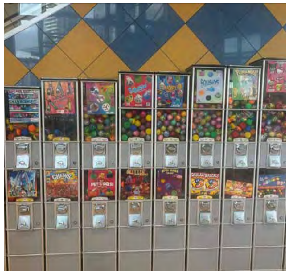
Beaver gumball vending machines at Metrotown Mall