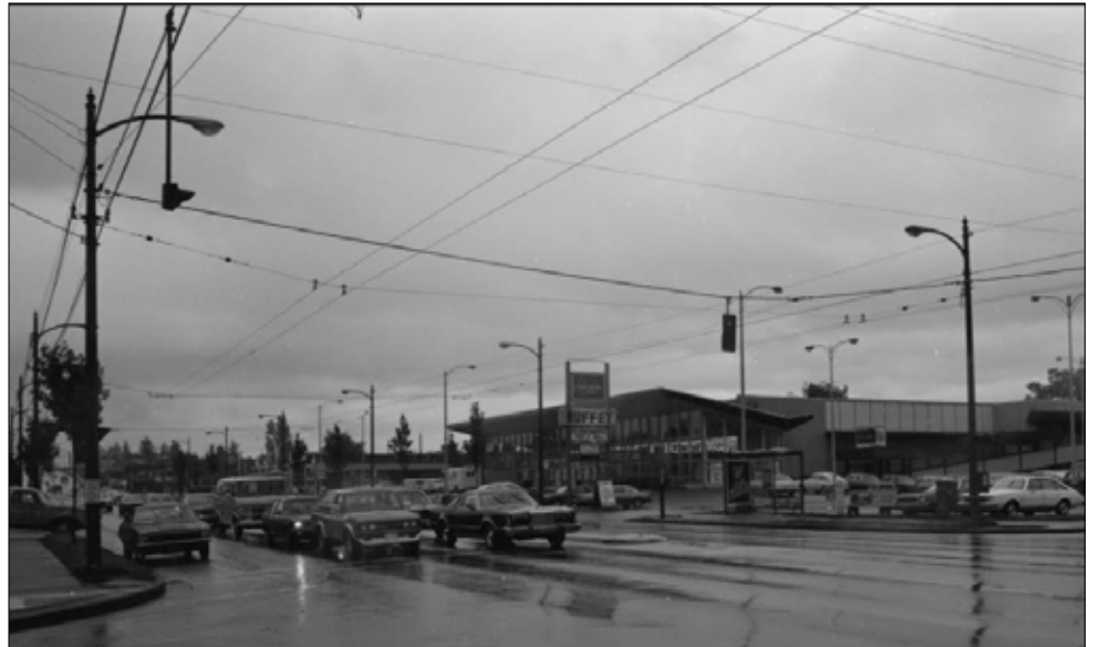
1982 Kingsway and Gladstone. Copper Kettle restaurant above Dominion grocery store, later an IGA store.

There are two gumball machine locations at Metrotown Mall in Burnaby. They are quite popular but now accept a $2 coin for the plastic toys inside. I tried one out the other week, and that satisfying twist of the