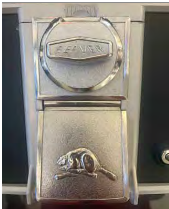
Beaver motif and name on closeup of a gumball vending machine at Metrotown Mall.